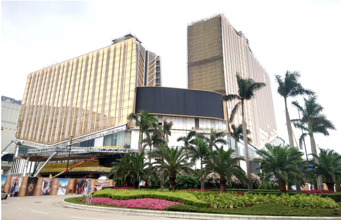
Photograph of Galaxy International Convention Center, Galaxy Arena and Andaz Hotel towers