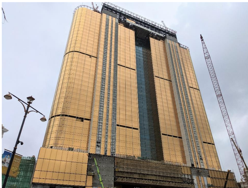
Photographs of Raffles at Galaxy Macau